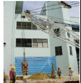
Bored Pile Hammer Grab