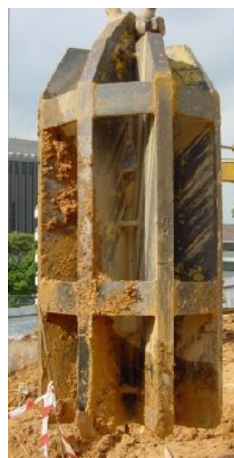
Chisel (for hard to very hard rocks)