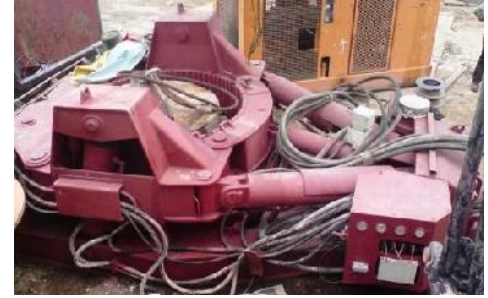
Double Wall Casing Oscillator