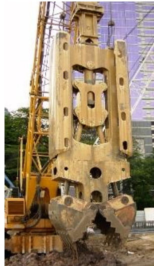
Soilmec BH12 DW grab