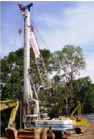
Soilmec R618 #1052