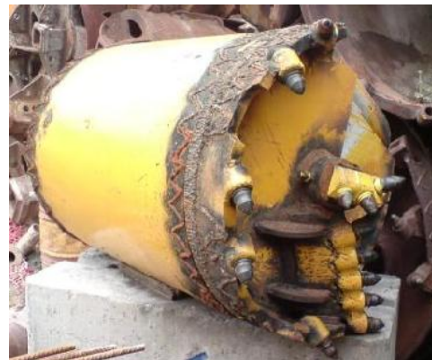
Rock Boring Bucket (for medium hard to hard rocks)