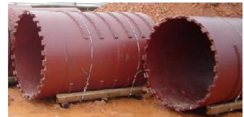
As Stollen Core Barrel (for medium hard rock & concrete)