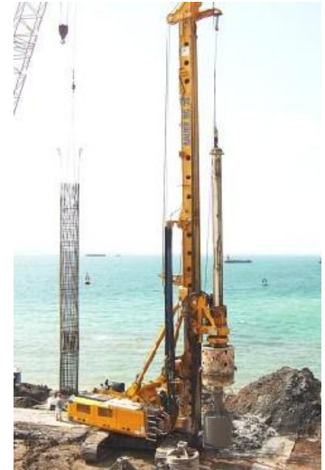
Bauer BG28 #851