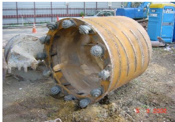
Rock Roller Bit Core Barrel (for very hard rocks)