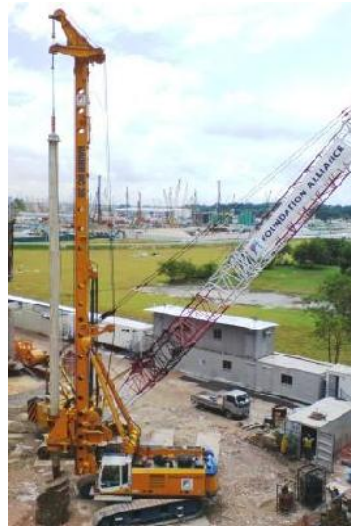
Bauer B28 #1094