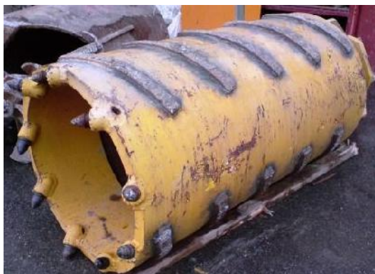
Round Shank Core Barrel (for medium hard to hard rocks)