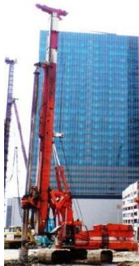
Soilmec R16 #1068