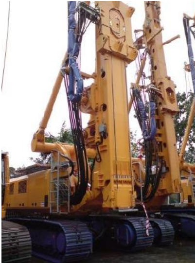
Bauer BG36 #2088